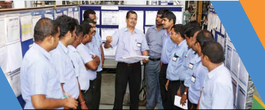
A daily work management (DWM) session in progress at TIDC India as part of the OPEX programme