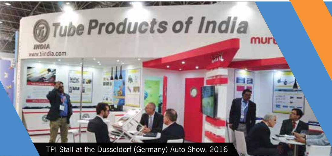
TPI Stall at the Dusseldorf (Germany) Auto Show, 2016