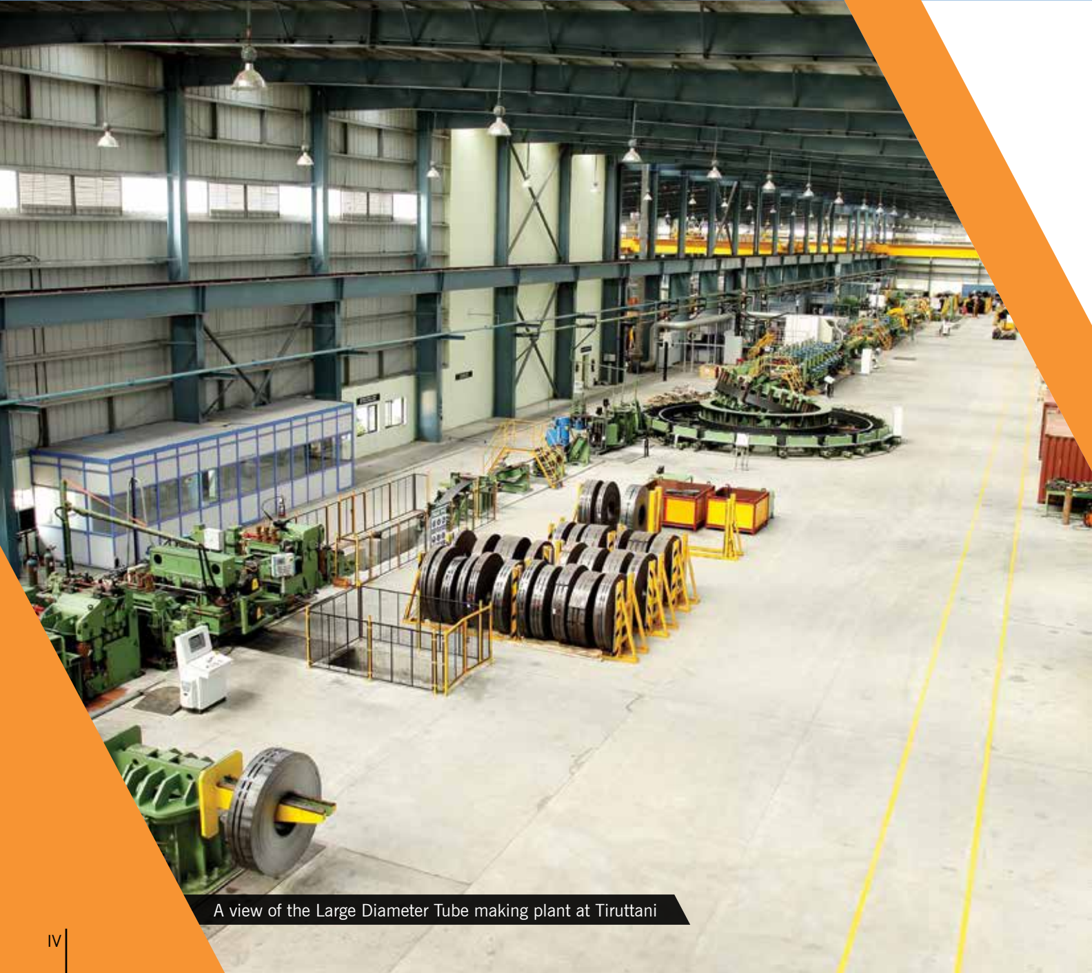
A view of the Large Diameter Tube making plant at Tiruttani