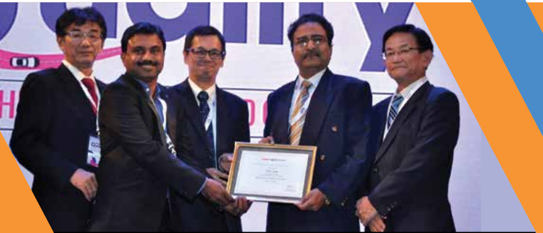
TIDC team receiving award for quality from a Japanese auto OEM