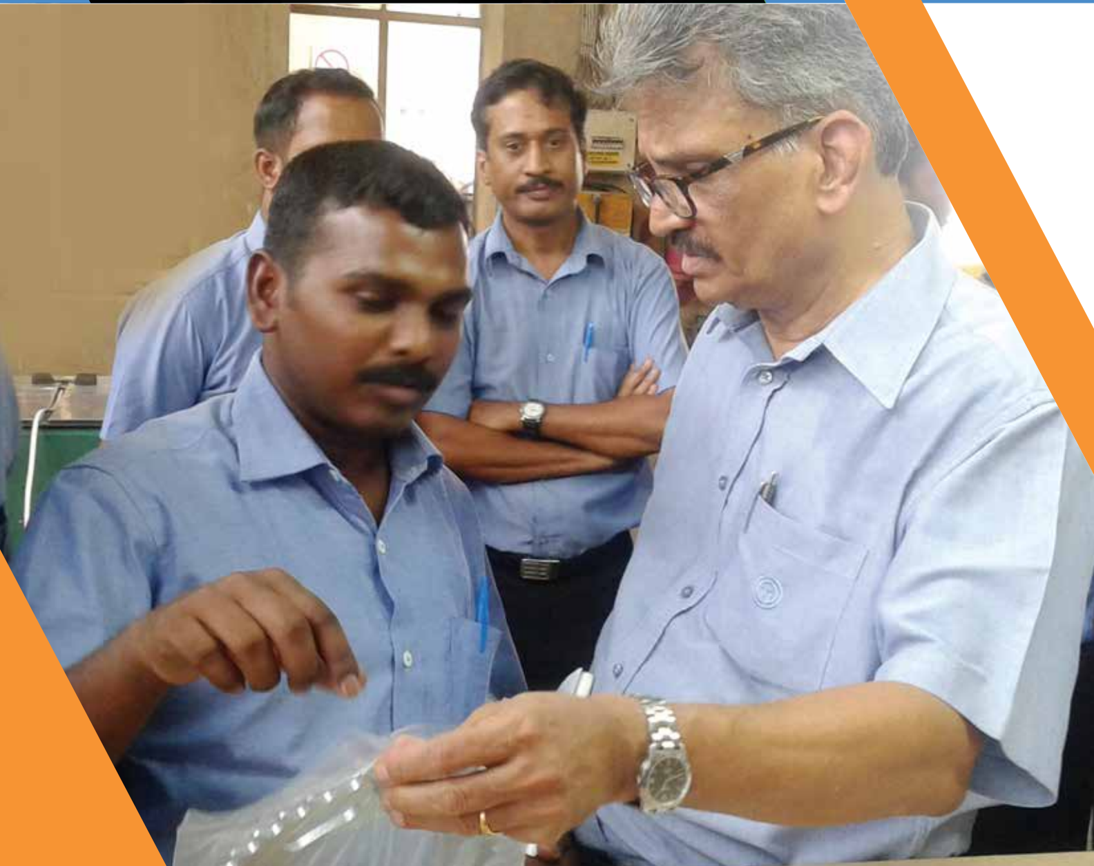
Managing Director interacting with an employee on his team's project under TEI (Total Employee Involvement) programme at TIDC India