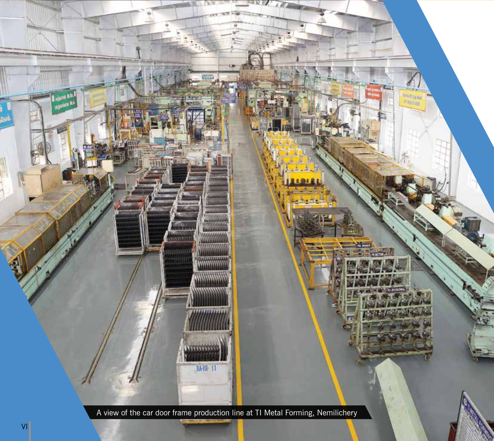
A view of the car door frame production line at TI Metal Forming, Nemilichery