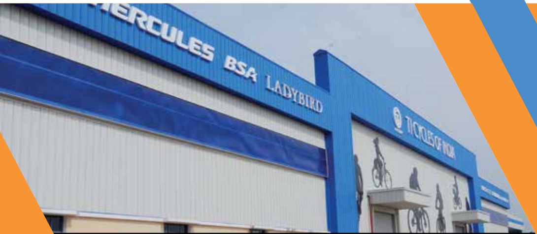
The new Rajpura Bicycle manufacturing plant