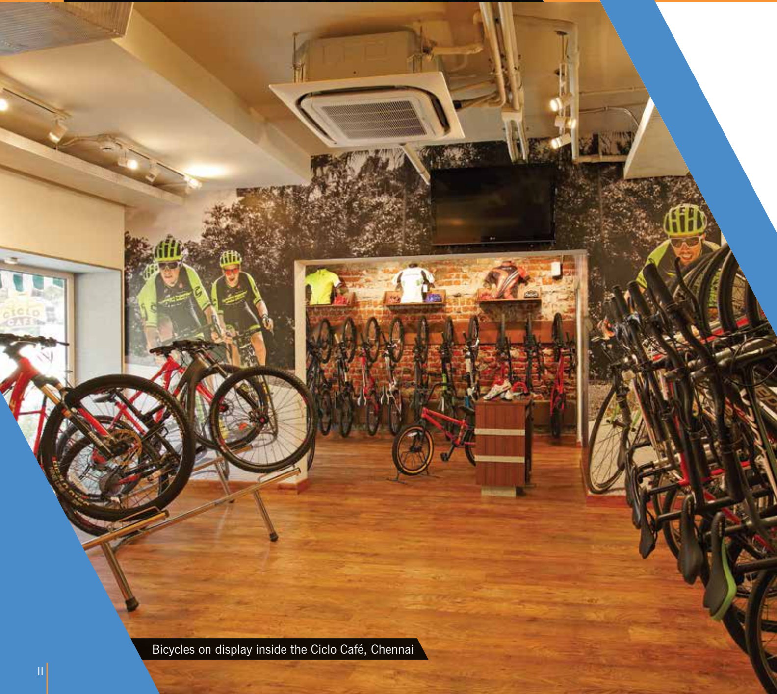
Bicycles on display inside the Ciclo Café, Chennai